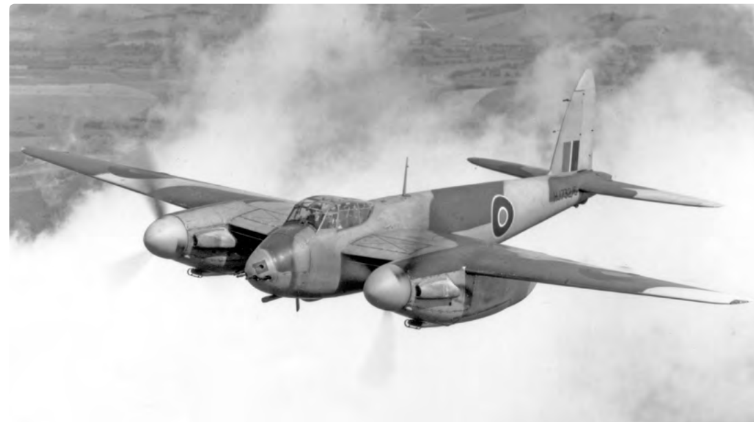
BAE SYSTEMS X.2

T HE BATTLE OF the Atlantic, like RAF Bomber Command's campaign against Germany, employed the most advanced technology of the Second World